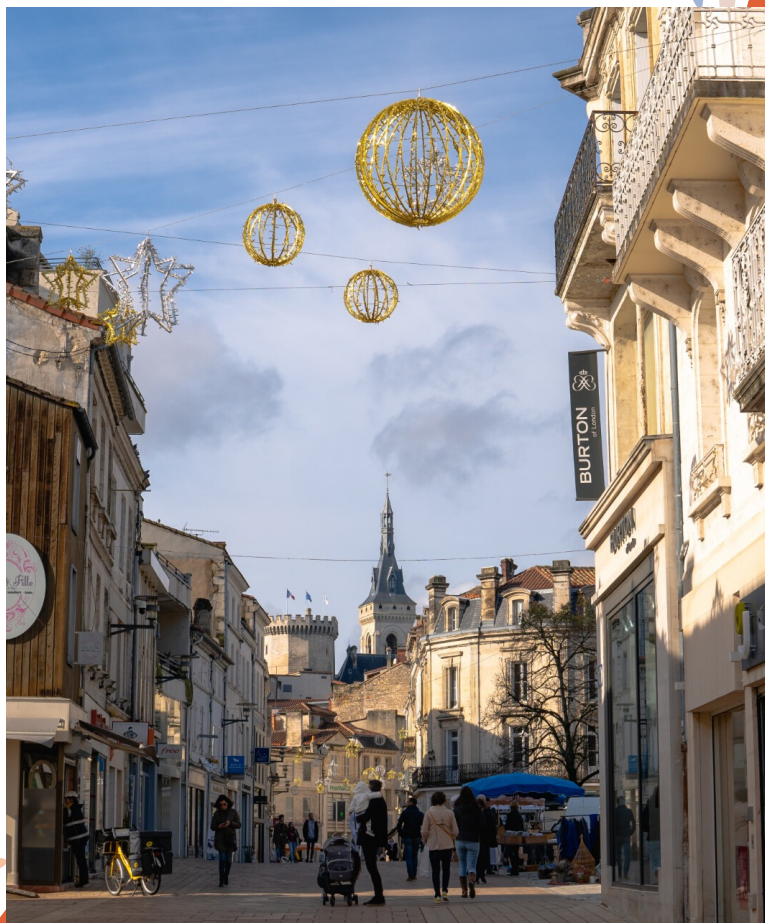
ANGOULEME DURING CHRISTMAS TIME

How to do it? Our volunteers will organize activities with the goal of promoting European mobility opportunities . For both local youngsters and our four European volunteers it will be a chance to build linguistics, cultural and social competences.